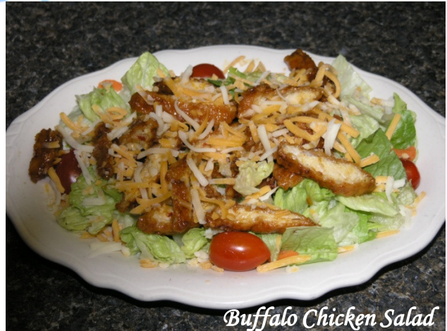
Buffalo Chicken Salad

M French Onion A crock of our signature French onion soup served with a crustini and melted provolone cheese. 3.95