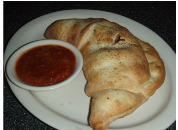
Fresh Dough Calzone

Every calzone is hand-prepared to order, preparation and baking requires more time than other menu items. Additional stuffing's. $1.50