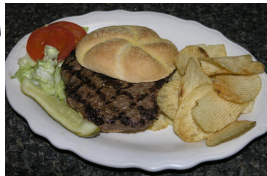
1/2 lb Black Angus Burger

M Chicken Parm Sandwich Breaded chicken breast topped with marinara and provolone served on a Keiser bun. 6.25